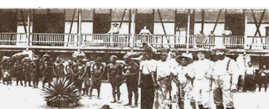
Plate 1 The Basel Mission Station at Bombe