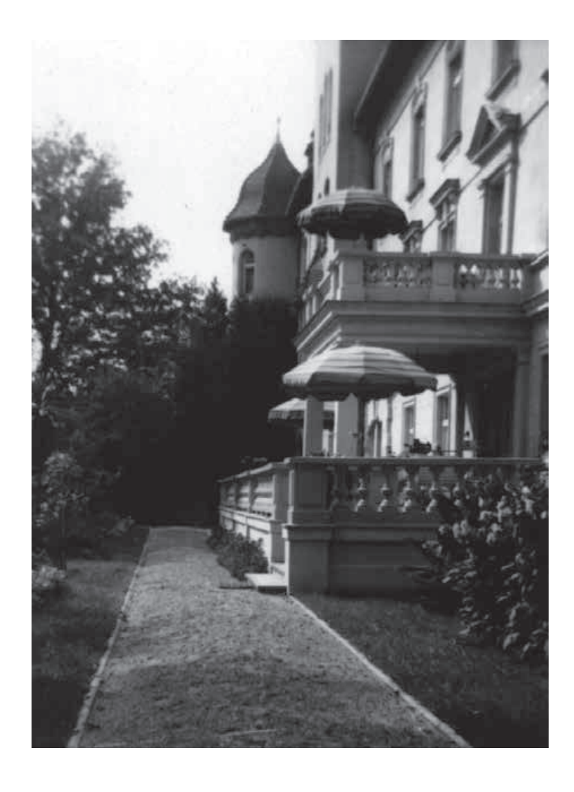
The Osieczna Castle in the 1920s. Photographs from the Institute collection.